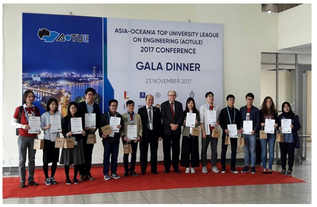
AOTULE Conference 2017 Hanoi University of Science and Technology