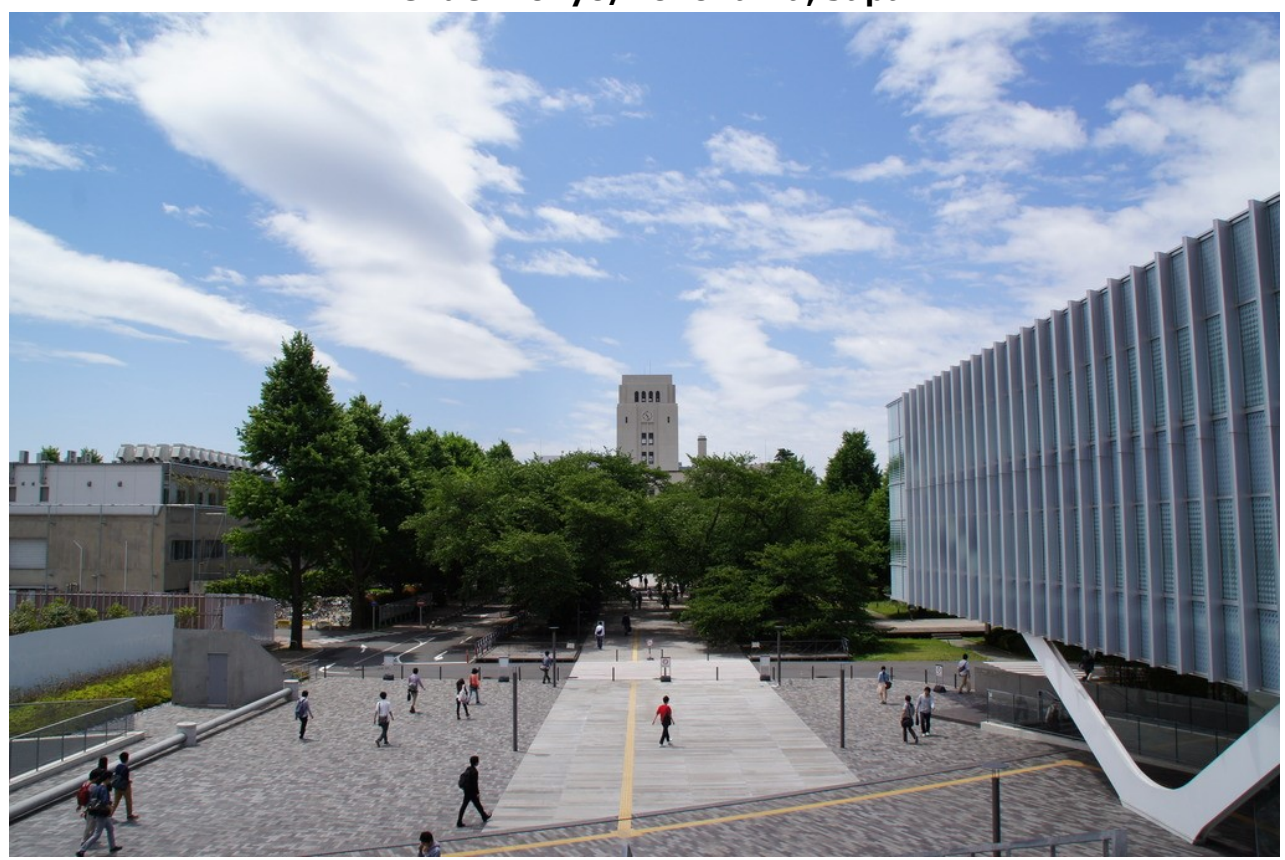
Main Building & Library, Ookayama Campus, Tokyo